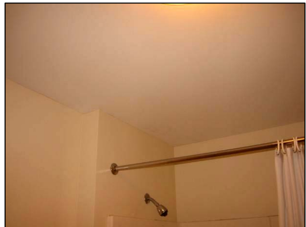
Visible light image of location at left